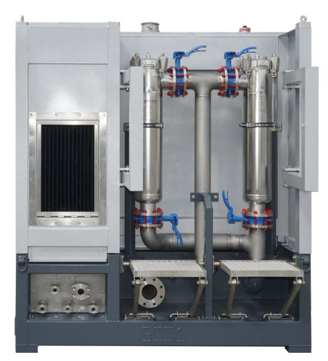
4" Duplex filters, externally mounted