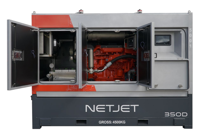
Highly accessible for routine maintenance and servicing